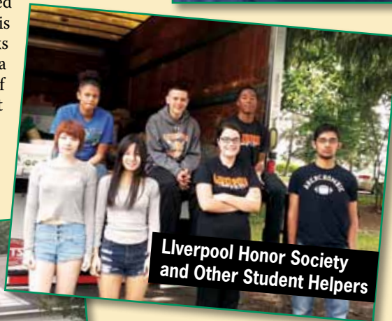
Liverpool Honor Society and Other Student Helpers