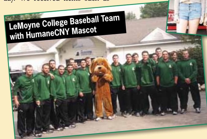
LeMoyne College Baseball Team with HumaneCNY Mascot

canned food, litter, laundry detergent, and bleach – all the items we need the most. Winter is long – so please don't forget us... we have a shelter full of adoptable animals 365 days a year, so our needs never stop.