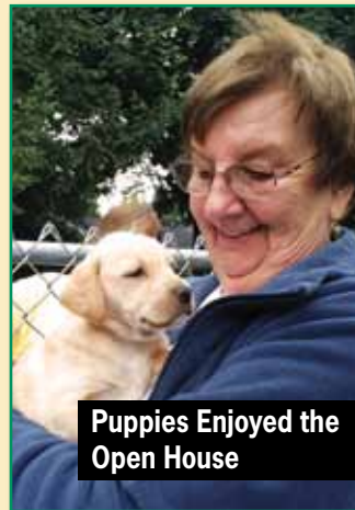
Puppies Enjoyed the Open House

As the event is coined "Drop-A-Thon," we are always very grateful to all the people who took the time to collect and drop off shelter supplies that day. We received items such as