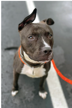
→ Dragon Fruit will need her eye removed due to severe infection