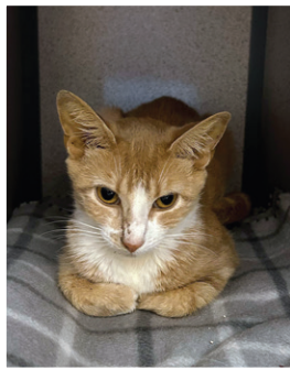
← Toby enjoys human affection despite his difficult past.