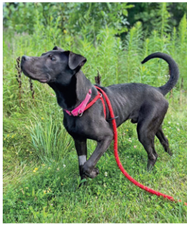
← Marty enjoys some fresh air as he gains weight at the shelter.