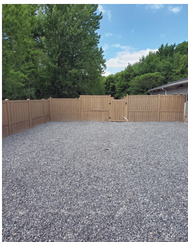
Renewed dog play yards