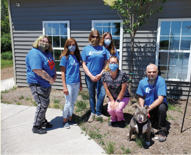
HumaneCNY staff is ready to welcome visitors