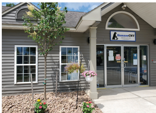
Spruced-up shelter entranceway