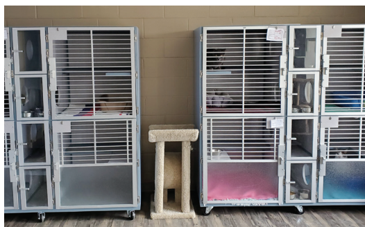
More spacious cat housing

Non Profit Org. U.S. Postage PAID Permit No. 994 Syracuse, NY