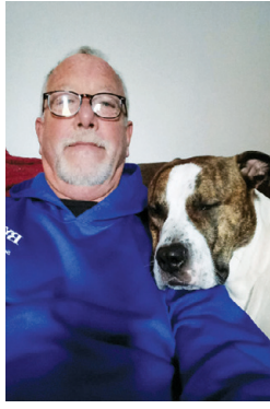
Jack enjoying his new family.

Back in May 2021, a small shelter from NY's southern tier asked for our help, and we took in Jack, a pit terrier mix, who was in danger of being put down due to lack of kennel space. Jack arrived, as so many do, needing time to decompress. Jack was very shy, so we started by sitting quietly with him and quickly discovered that he loved to play, especially outside. Chasing balls helped him work off stress and have fun with people and dogs in a carefree way.