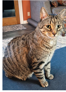
Bubba showing off his new found confidence!

Dog enrichment volunteers took Jack for daily runs and car rides to doggy parks and ice cream stands. Jack became a friendly, loving pup, an ideal pet! So why was Jack still with us 8 months after he arrived? The answer is that there are too few homes for large active dogs like Jack. Shelters must work hard to keep these dogs mentally and physically challenged for months, while actively searching for the perfect match. We were delighted when Jack found his perfect home on New Year's Eve, ready to start his happiest life.