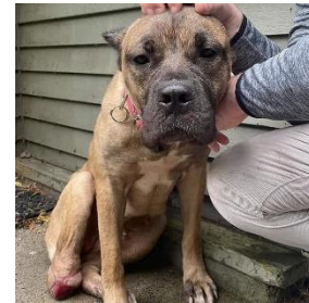
Lily when she was found

For instance, Lily, a lovable Mastiff mix, arrived mangled after being tied outside with a rope twisted around her leg. Despite being failed by humans, Lily was an extremely sweet girl. We bandaged her injured leg, gave her pain meds, and promptly scheduled the amputation she desperately needed. Sadly, abuse and neglect cases like Lily's have more than doubled over last year. HumaneCNY's ongoing ability to fund medical care is very important to our community— that's where you come in!